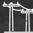
POWER TRANS- MISSION